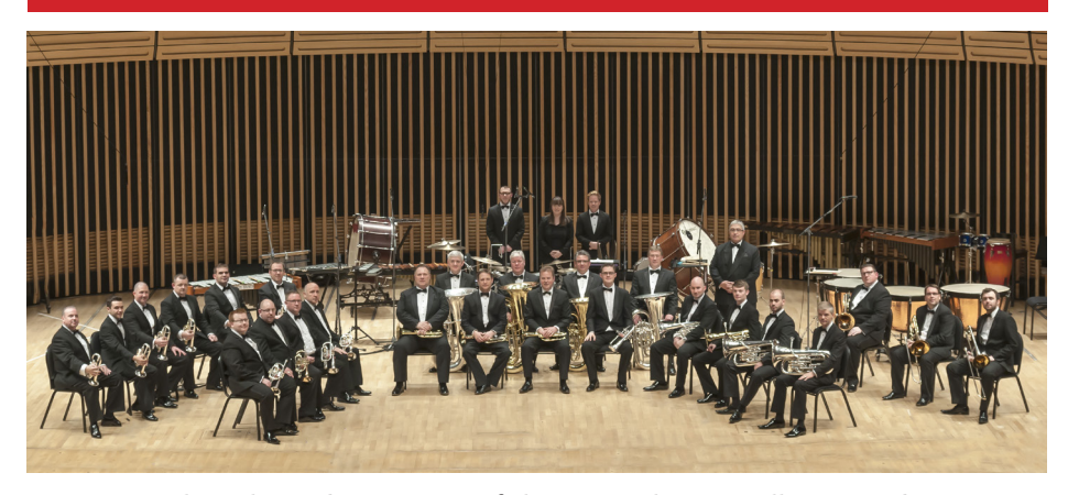
The talented musicians of the Grimethorpe Colliery Band

I am thrilled to become Grimethorpe Colliery Band's Honorary President in its centenary year.